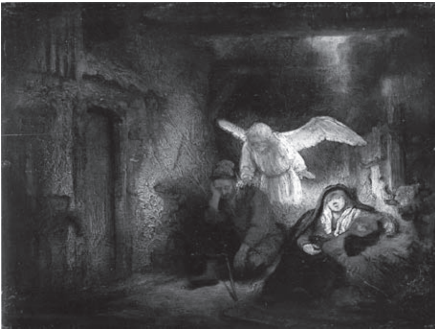
Dreams in Holy Scripture: The angel appears to Saint Joseph telling him to leave Bethlehem and to flee to Egypt. Rembrandt van der Rijn, 1645.

a long period of suffering, my eyes were opened. The Bible warns about the negative experiences I had endured and so I understood what had happened to me.