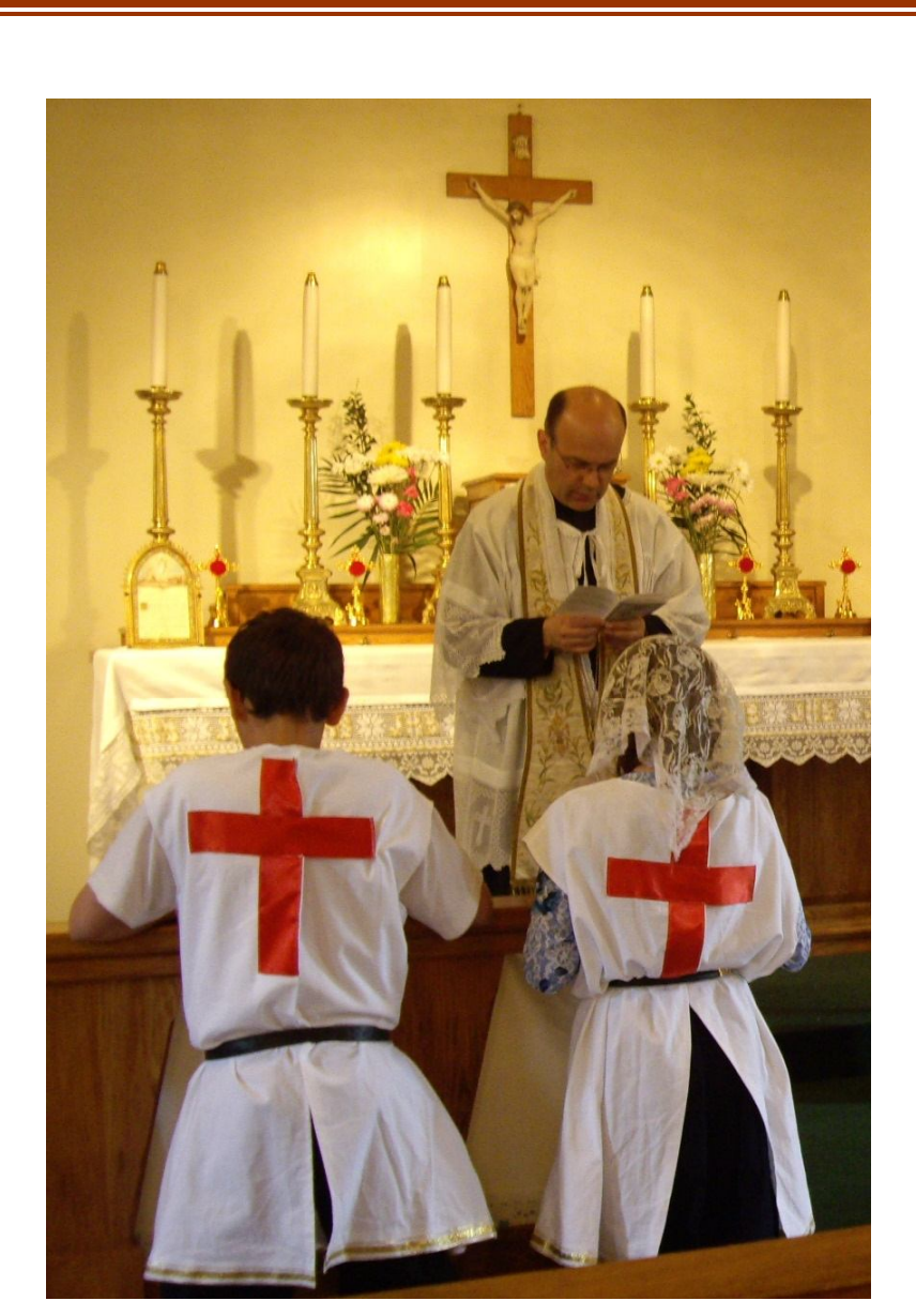
THE GUARDIAN OF CRUSADERS Bulletin of the Eucharistic Crusade for Canada February 2009 # 188