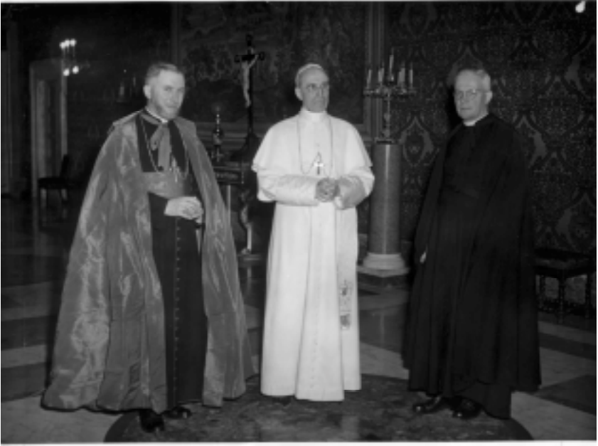
As a missionary bishop in Africa, Archbishop Lefebvre used to meet frequently with Pope Pius XII