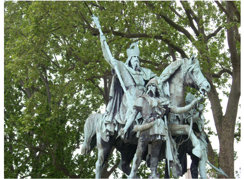
Statue of a true Catholic king, Charlemagne, by Notre-Dame cathedral in Paris, France

The Crusader offers up his day with all its prayers, spiritual communions and sacrifices for the intention received from Bishop Fellay, the second successor of Archbishop Lefebvre as the Superior of the Society of St. Pius X.