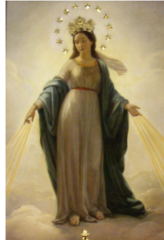
Painting of the Immaculate Conception, from the Church of San Andrea della Frate in Rome, that witnessed the conversion of the Jew Alphonse Ratisbonne

The Crusader offers up his day with all its prayers, spiritual communions and sacrifices for the intention received from Bishop Fellay, the second successor of Archbishop Lefebvre as the Superior of the Society of St. Pius X.