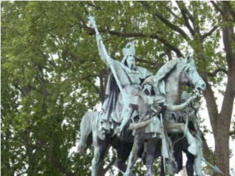
Statue of a true Catholic king, Charlemagne, by Notre-Dame cathedral in Paris, France