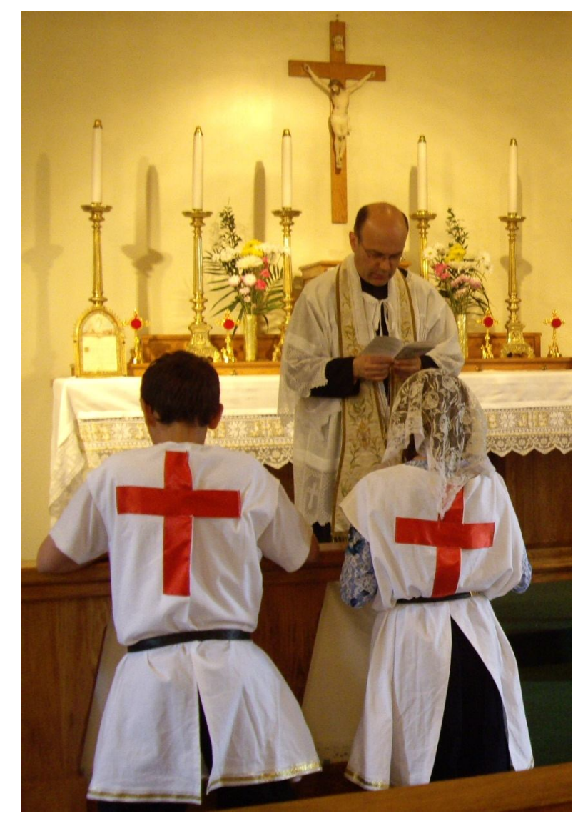
THE GUARDIAN OF CRUSADERS

Bulletin of the Eucharistic Crusade for Canada