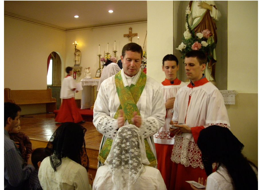
A newly ordained priest giving his blessing at St. Joseph's church, in Montréal