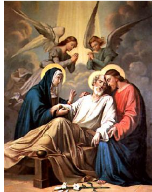
The death of St. Joseph