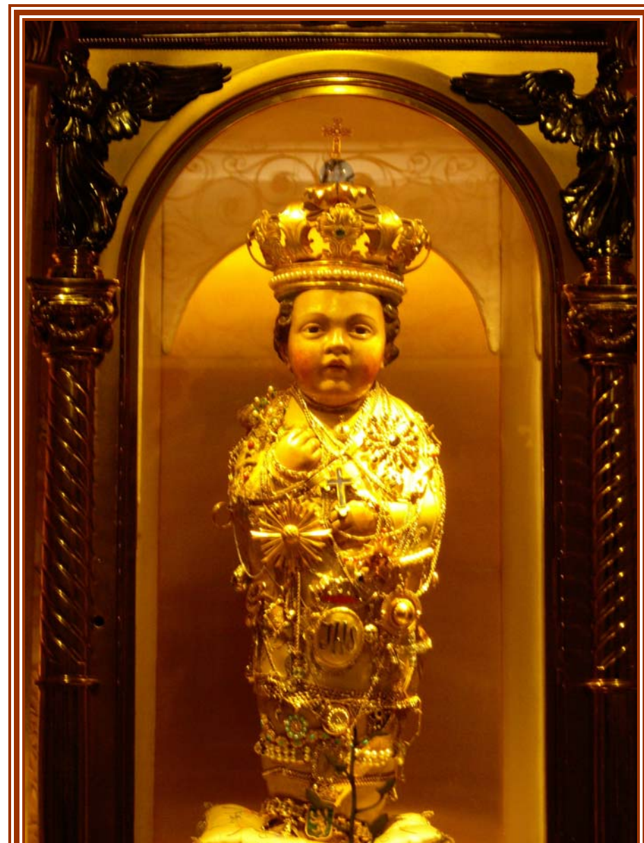
The Bambino Jesus, from Rome