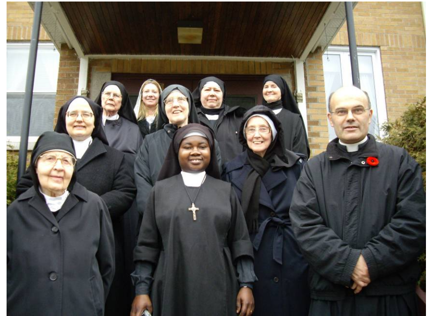
Oblate sisters of the Society of St. Pius X