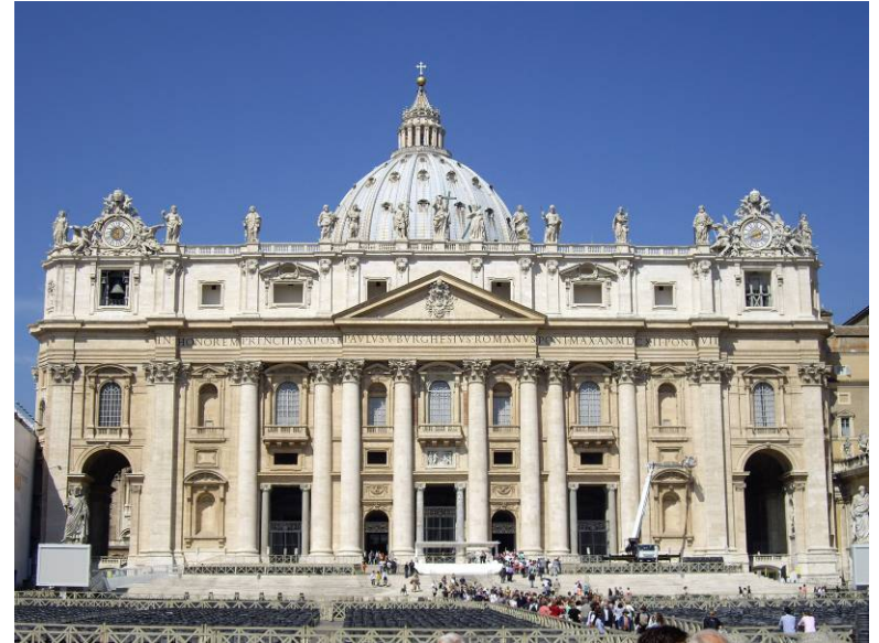
St. Peter's basilica in Rome