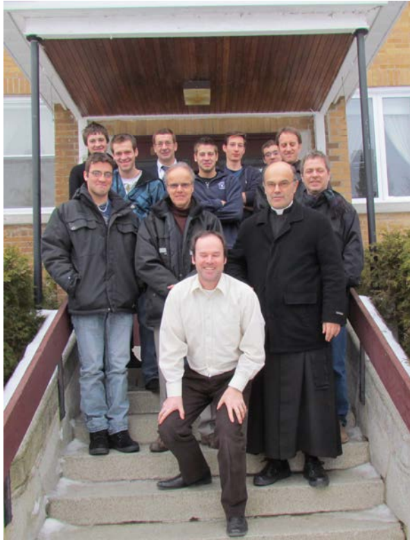
Men's retreat at Shawinigan