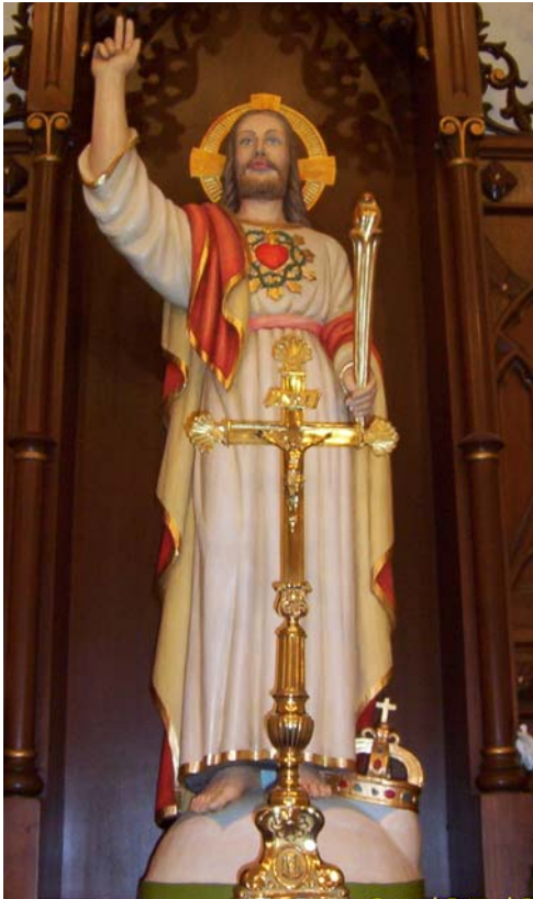
Statue of Christ the King, from Langley, BC

The Crusader offers up his day with all its prayers, spiritual communions and sacrifices for the intention received from Bishop Fellay, the second successor of Archbishop Lefebvre as the Superior of the Society of St. Pius X.