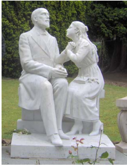
St. Therese of the Child Jesus with her father

The Crusader offers up his day with all its prayers, spiritual communions and sacrifices for the intention received from Bishop Fellay, the second successor of Archbishop Lefebvre as the Superior of the Society of St. Pius X.