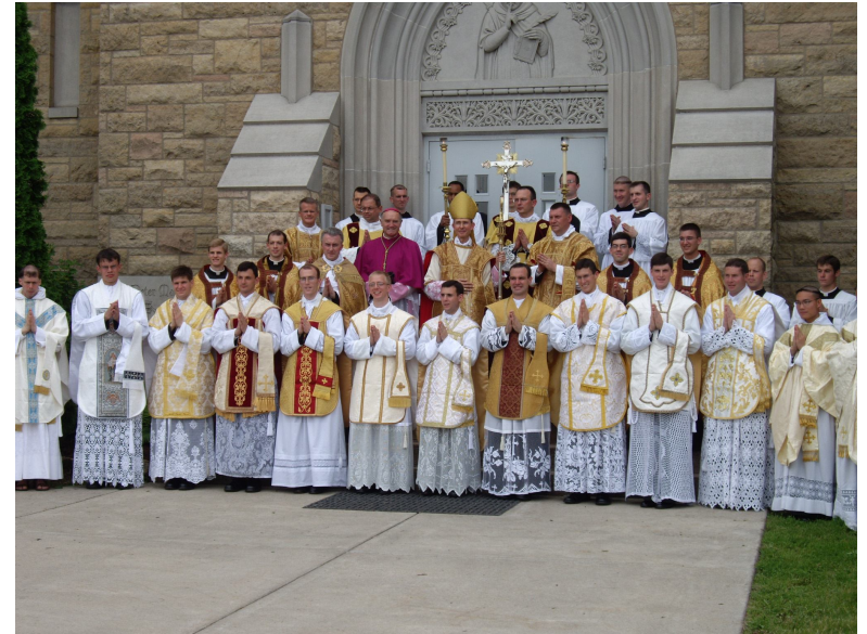
Priestly Ordinations in Winona